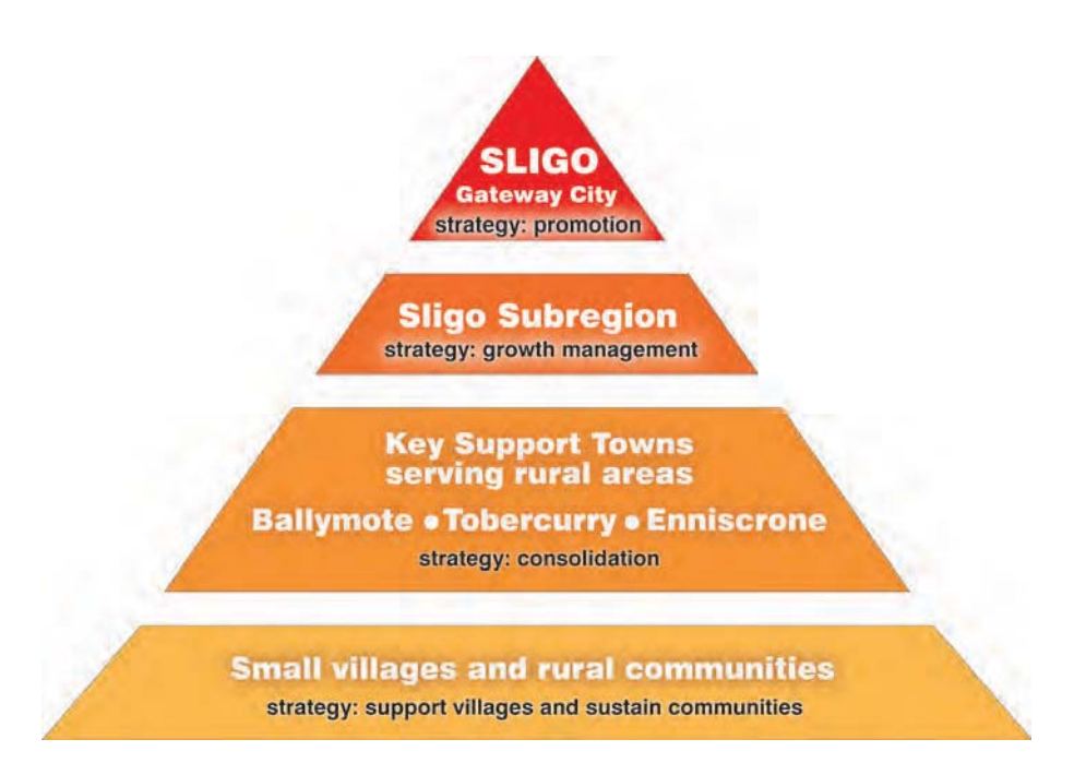
Fig. 3.C Settlement Structure - guiding principles

County Sligo's Settlement Structure has been prepared in parallel with the Border RPGs and takes due cognisance of the Guidelines' requirements. The Settlement Structure reflects the Spatial Development Framework outlined in Section 3.2, which sets out the principles for orderly growth in the County. These principles are illustrated in Fig. 3.C below.